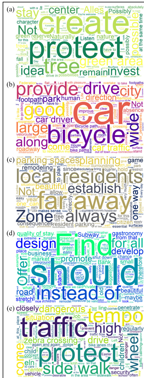
Figure 1. Wordclouds show the most probable words that appear in topics assigned to a single public value. (a) The public value of ecologic quality centres around the creation and protection of green spaces. (b) The public value of social equity mainly reflects the provision of better bicycle lanes for better accessibility. (c) The public value of economic opportunity is largely concerned with the provision of parking spots for local residents. (d) The public value of liveability reflects certain wishes for the built environment regarding design that should be realised. (e) The public value of health/safety indicates the wish for better protection from dangerous traffic situations.